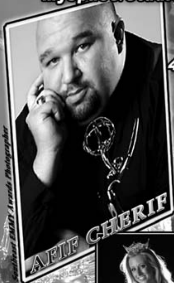
Southeast DMM Awards Photographer